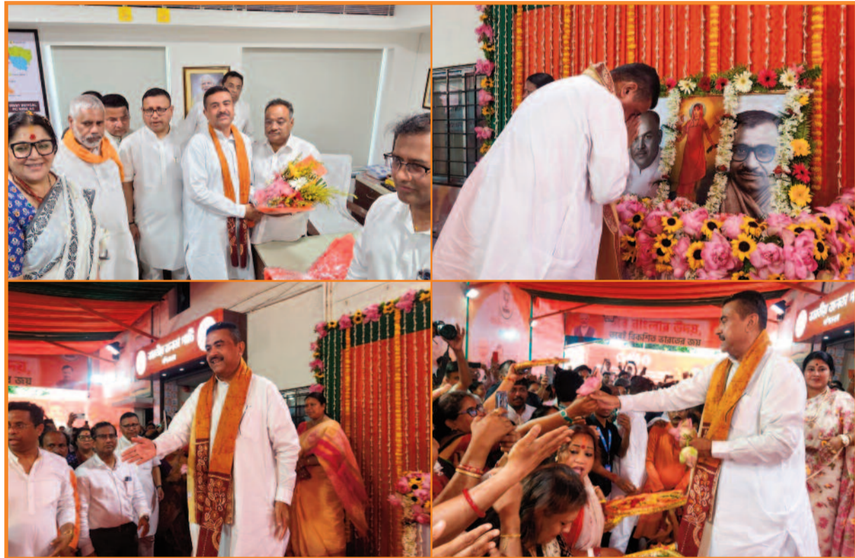
West Bengal Chief Minister Suwendu Adhikari with other BJP leaders, Monday.

sparked a major controversy, with the opposition accusing her of insensitivity. Even the Calcutta High Court termed the remark "unfortunate." The conflict between the government and its employees over pending DA arrears has also intensified. A section of teachers took to the streets to stage protests—a movement to which Suwendu extended his support. At the time, Suwendu—then the Leader of the Opposition in the State Assembly—even advised the protesting government employees to padlock the doors of their respective offices. The Supreme Court has not yet issued a final, definitive order mandating the immediate disbursement of pending DA arrears; the case remains sub judice and has undergone hearings at various stages.