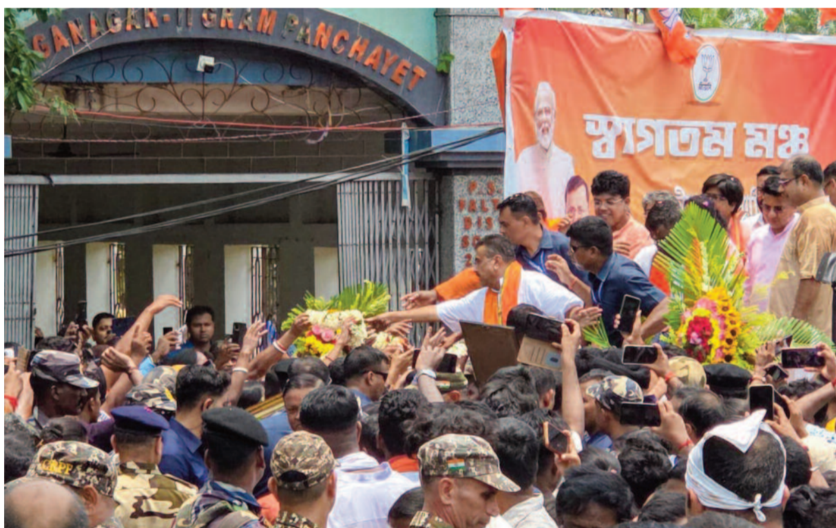
West Bengal Chief Minister Suwendu Adhikari holds a roadshow in support of BJP candidate for the Falta constituency, Debangshu Panda, on the final day of campaigning for the May 21 repoll, in South 24 Parganas.

opposition structure" inside the constituency. Political analysts believe this reflects a strategic shift from symbolic opposition politics to hyper-local issue-based mobilisation. The Ward That Was Left Out The biggest political mystery surrounding the announcement is the exclusion of one ward from the proposed expansion blueprint. While official explanations remain unclear, the omission has already sparked speculation inside political and media circles. Some observers believe the excluded ward may have internal organisational complications, while others suspect that the decision could be linked to electoral calculations, factional equations, or demographic strategies. Opposition leaders have so far avoided giving a direct explanation, further fueling curiosity. Local political workers say the omission has become the central talking point in Bhabanipur, with many questioning whether the decision reflects deeper strategic tensions within the constituency. Direct Challenge to the Ruling Establishment Bhabanipur carries enormous symbolic value in Bengal politics.