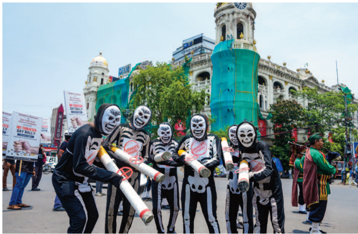
People take part in an awareness rally on the World No Tobacco day, in Kolkata, Sunday.

civic administration, where residents can play a direct role in monitoring cleanliness and ensuring accountability in municipal services. In a pointed warning that appeared directed not only at political opponents but also at public representatives across party lines, he stated that anyone found collecting illegal money, exerting unlawful pressure, or exploiting public office should face legal consequences. The message carried particular significance because it included elected lawmakers themselves. According to Bhattacharya, MPs, MLAs, municipal leaders, and local representatives should be held to higher standards of conduct than ordinary citizens because they have been entrusted with public responsibility.