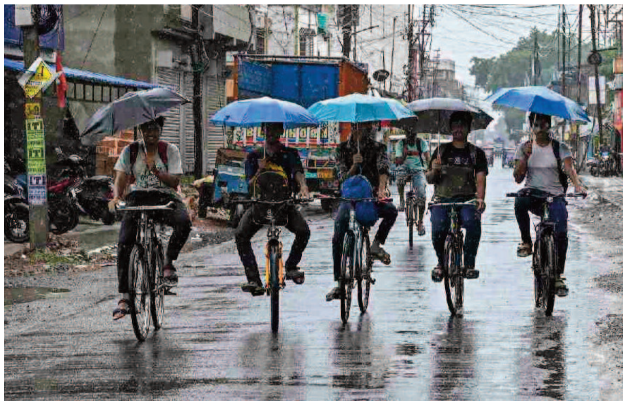
People cover themselves as they cycle in the rain, in Nadia, Bengal, Sunday.

campus or district-level facilitation centres. Offline application forms at designated offices. Authorities have advised applicants to wait for the official notification and avoid unofficial registration websites or fraudulent claims. Current Status: The Yuva Shakti Bharosa Card Scheme has been announced as a proposed unemployment assistance programme, but its full implementation, eligibility rules, and application schedule are expected to be clarified through an official government notification. Until then, interested candidates should monitor official announcements for updates on registration dates and operational guidelines. According to Adhikari, many patients—particularly those from rural and economically weaker backgrounds—are forced to travel long distances.