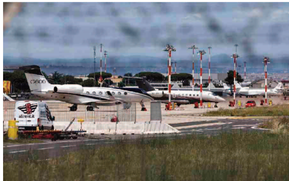
Private jets are parked at Rome Ciampino airport, as aviation operators monitor higher jet fuel costs and supply concerns amid the Iran war, in Ciampino, Italy.

comes a Major Political Talking Point Ayushman Bharat is among India's largest publicly funded health insurance programs, offering financial protection for secondary and tertiary medical treatment to eligible families. Supporters of broader implementation argue that integrating the scheme across West Bengal could reduce out-of-pocket healthcare expenses and provide relief to economically weaker sections. The program allows beneficiaries to receive cashless treatment at empanelled hospitals for a wide range of medical procedures. Observers believe that expanding access to national healthcare schemes could significantly improve health outcomes, particularly in rural and underserved regions where medical costs often push families into financial distress.