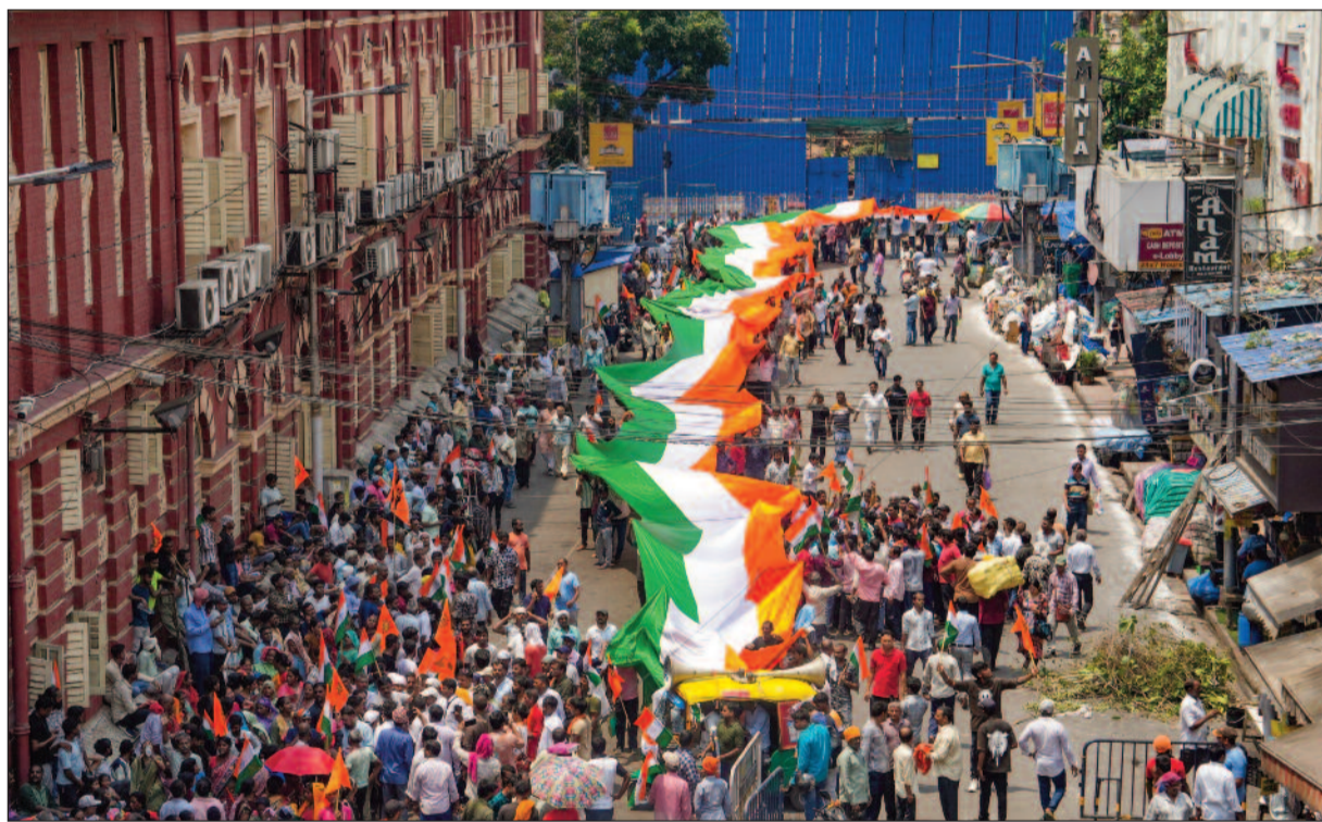
Clay artisans carry a long tricolour flag as they take out a rally from Ramlila Maidan to Rani Rashmoni Avenue to submit a memorandum to the Chief Minister, demanding measures to address the acute shortage of clay and alleging inaction against so-called soil mafia by the previous government, in Kolkata.

realignment. Focus on Development and Governance According to officials familiar with the meeting, discussions centered on accelerating infrastructure projects, improving healthcare services, expanding educational facilities, strengthening rural connectivity, and ensuring efficient delivery of government welfare schemes. District administrators reportedly presented progress reports on ongoing initiatives while legislators highlighted local concerns requiring immediate government attention. The Chief Minister emphasized timely execution of projects and greater accountability among implementing agencies. Development experts argue that participation by MPs from different political backgrounds can help improve coordination between state and parliamentary constituencies.