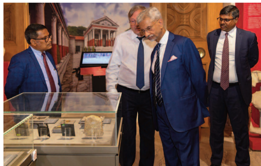
External Affairs Minister S Jaishankar visits the National Historical Museum, in Sofia, Bulgaria.